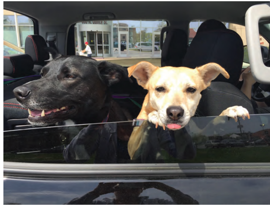
My second - Carly "the cutest girl" Rae

One of my more challenging – and most rewarding – times was with the last of my fosters (also my foster failure) Cindy. Cindy came from San Antonio following the Houston Hurricane. We committed to fostering, noting that she was “shy but warms up quickly.” Shy, yes, warms up quickly, no. Not only was Cindy a nervous nelly but she also didn't know how to walk on a leash, didn't like men (sorry, husband), wasn't sure of kids and barked like beagle mixes do. None the less, we went to adoption event after adoption event. Eventually realizing that she was just better off with me at the adoption table, then realizing she was just better off with me. It took about 18 months of fostering to fail – but fail I did. Honestly, I think Cindy adopted me way before I adopted her... it just took me longer to figure it out.